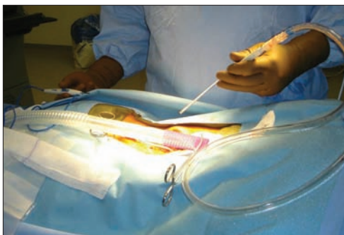
▲ TUBE STATION Position plume capture devices within 2 inches of where surgical smoke is generated.

• Suction power. This is measured as the velocity of air movement at the suction tip. Devices designed for fluid removal do not always have adequate suction power to remove contaminants from the air, despite what manufacturers of those devices might claim.